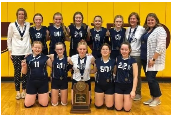
OUR 7TH GRADE STATE CHAMPS!

I can do all things through Christ, who strengthens me. Philippians 4:13