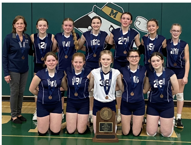
OUR 8TH GRADE THIRD PLACE TEAM!

JOIN US FOR LEARNING CAN TAKE US EVERYWHERE!