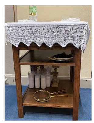
USING THE GIFTS GOD GAVE US

WOMEN'S GUILD RUMMAGE SALE FUNDRAISER: The Women's Guild will be holding a Rummage Sale Fundraiser in the parish hall on June 22-24. Donated items in good condition are needed for the sale such as books, jewelry, linens, toys, household items, decorations and miscellaneous items. NO CLOTHES! Drop off times the week of the sale will be Monday from 1-4pm, Tuesday & Wednesday from 10am-6pm, Thursday from 10am-1pm. The Rummage Sale will be open to the public on Thursday from 4-7pm, Friday from 9am-3pm and Saturday, bargain day, from 9-11am.