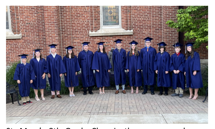
St. Mary's 8th Grade Class in the prayer garden on graduation night, May 24.