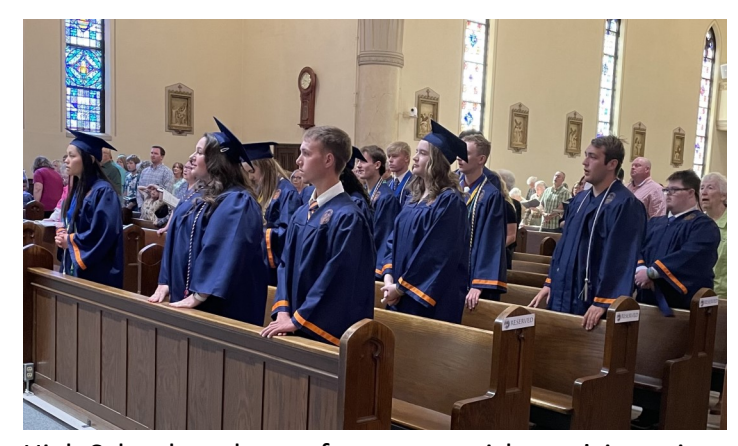
High School graduates from our parish participate in our annual Graduate's Mass on Sunday, May 21.